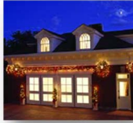
The Carriage House with Holiday Lights

You are cordially invited to attend the FEI Colorado Chapter 2009 Spring Social at the Carriage House at the Governor's Mansion